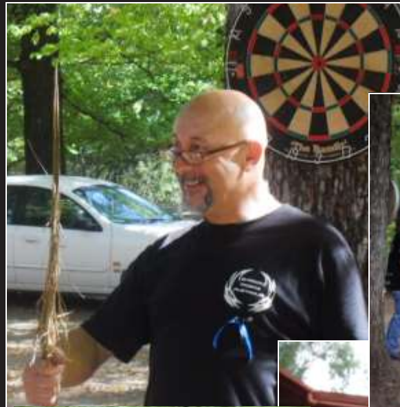
Below images. Then there were activities like Darts. Before some spat the dummy.